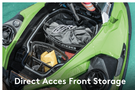
Direct Access Front Storage

An innovative hull that sets the benchmark for rough water handling, stability, and offshore performance.