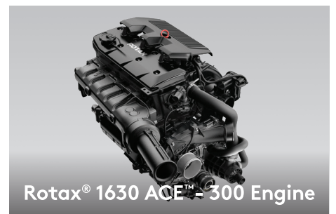
Rotax® 1630 ACE™ - 300 Engine

Large front storage area that's easily accessible from a seated position. 1