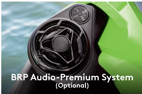
BRP Audio-Premium System (Optional)

The industry-first manufacturer-installed, truly waterproof, Bluetooth® audio system.